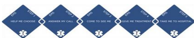
Figure 1 - Five Step Ambulance Care Pathway

The 5-step model is intended to ensure the ambulance service is providing the right response for a patient dependent on their clinical need.